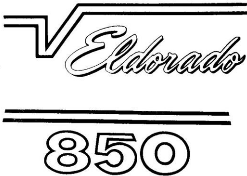
Eldorado sidecover/toolbox set $30