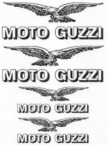
Ambassador & Eldorado Tank/fendertip decals $10/set